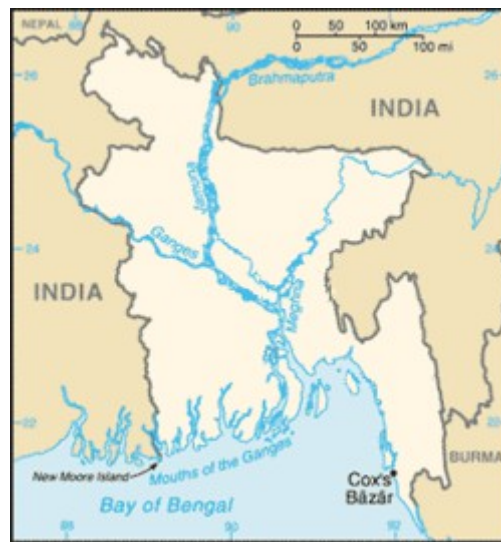
Location of Cox's Bazar in Bangladesh