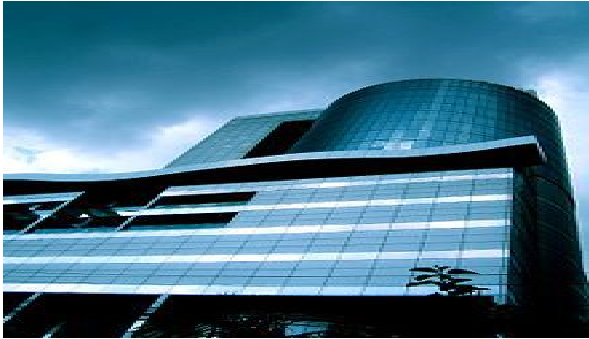
(Bashundhara City Market)

Almost every bank operating in Bangladesh has an outlet in Tejgaon. Foreign banks such as