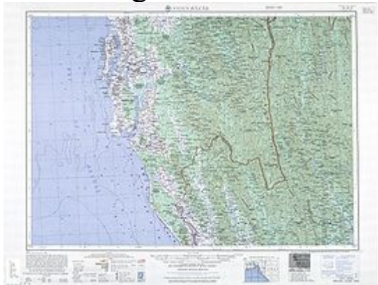
(Cox's Bazar Map from Series U542, U.S. Army Map Service, 1955)