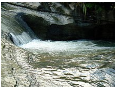
(Natural Stream from Hills)

Chakaria: One of most large area in Cox's Bazar.