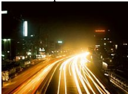
Nightview of Uttara

United Airways has its head office in the Uttara Tower in Uttara Thana. RAK Tower & ABC Tower of ABC Developer Company is at Jashimuddin Avenue in Uttara Thana. Local super market chains such as Agora, Shop 'n Save, Nandan Megashop and Family Needs operate in Uttara. Also, the leading American car manufacturer Ford has its showroom situated in Abdullahpur.