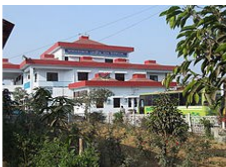
(Cox's Bazar Bus Terminal)