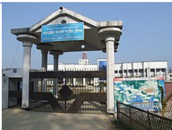
(Submarine Cable Landing Station)

As one of the most beautiful and famous tourist spots in Bangladesh, the major source of economy in Cox's Bazar is tourism. Millions of foreigners and Bangladeshi natives visit this coastal city every year. As a result, a large number of hotels, guest houses and motels have been built in the city and coastal region. Many people are involved in hospitality and customer service orientated businesses. Number of "5 Star Hotels" currently being built in Coxsbazar climbs to 47 and rising. A number of people are also involved in fishing and collecting seafood and sea products for their livelihood. Various kinds of Oyster, Snail, Pearl and their ornaments are very popular with tourists in seaside and city stores. A number of people are also involved in the transportation business for tourists. Cox's Bazar is also one of the few major spots for aquaculture in Bangladesh. Along with Khulna, it is considered a major source of revenue