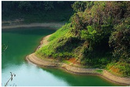
(Kaptai Lake at Rangamati.)

Bawm villages around Chimbuk, and Mru villages a little further off, are also lie within a day's journey from the town. Prantik Lake, Jibannagar and Kyachlong Lake are some more places of interest. And, a boat ride on the river Sangu is also an excellent proposition.